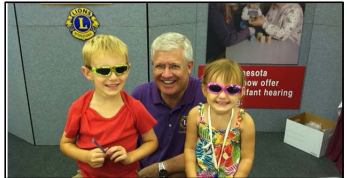
Lions Vision and Hearing Booth.

sunglasses they received from our booth. The Lions staffing the booth give out ultraviolet protecting sunglasses for children five and under and give out ear