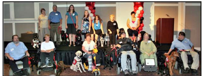
Graduation Day. Thirteen Graduates were honored at the Graduation Ceremony on August 13, 2011.