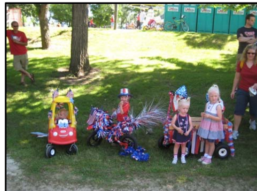
Shown at Left are some of the Kiddie Parade winners.