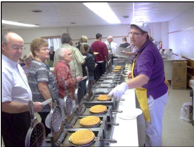
Belgian Waffles. Pictured here is Dad's Belgian Waffle cook, cooking up the waffles and many toppings.

On June 11th, the Goodhue Lions Club was active once again in providing nourishment to the masses by serving a Belgian Waffle breakfast at the club house in Goodhue. The club members served and assisted. The breakfast was part of the Goodhue Days weekend. The weekend also included a motorcycle and classic car