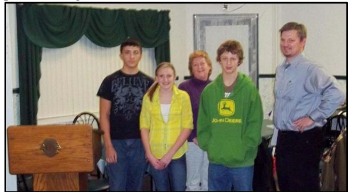
Lewiston-Altura Teachers and Students at the Lewiston Lions Club meeting.

The Lewiston Lions Club was privileged to have three young students from Lewiston-Altura Schools and two of their instructors present at the monthly Lions meeting on February 2nd at the Recreation Bar and Cafe. The students and instructors talked about how valuable the recently installed Lions Quest Program was to their curriculum and how it helped their fellow students by offering positive youth development and conflict prevention that unite the home, school, and community. The program builds healthy young people of strong character.