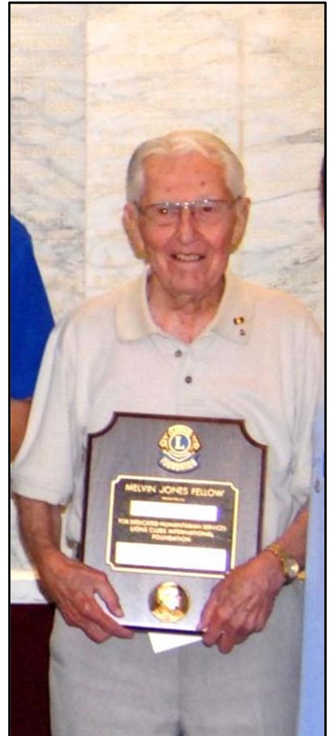
Seventy Year Lion